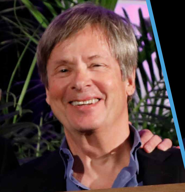
2023 NEXT PAGE HONOREE DAVE BARRY