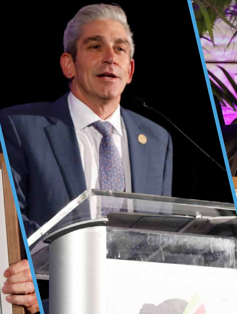
2023 NEXT PAGE HONOREE RICHARD BLANCO