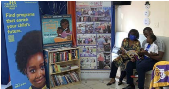
FREE BOOKS FOR KIDS